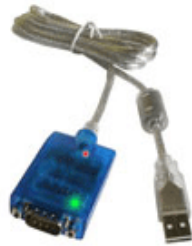
Windows 8 32/64-bit Ultimate Adapter

U.S. Converters sells a line of USB to serial adapters that offers all of the above features. We recommend one of these two converters for all newer operating systems: