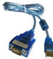
Windows 8 32/64-bit Professional Adapter