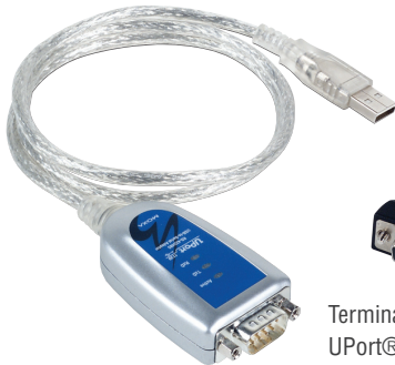
Terminal Block Adaptor for UPort® 1130/1130I/1150

1-port RS-232, RS-422/485, and RS-232/422/485 USB-to-serial converters